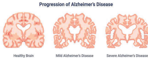
Fig 1: Stages in Alzheimer's disease (AD)

The person living with Alzheimer's may not be able to initiate engagement as much during the late stage, but he or she can still benefit from interaction in ways that are appropriate, like listening to relaxing music or receiving reassurance through gentle touch.