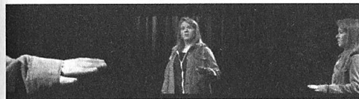
Figure 88. Still from Morley and Flanagan, The Question of Ireland

Morley and Flanagan asked three writers to imagine their own speeches on “The Question of Ireland.” They then had actors perform the speeches, which they filmed in Ireland’s national theater of Irish language, An Taibhdhearc.