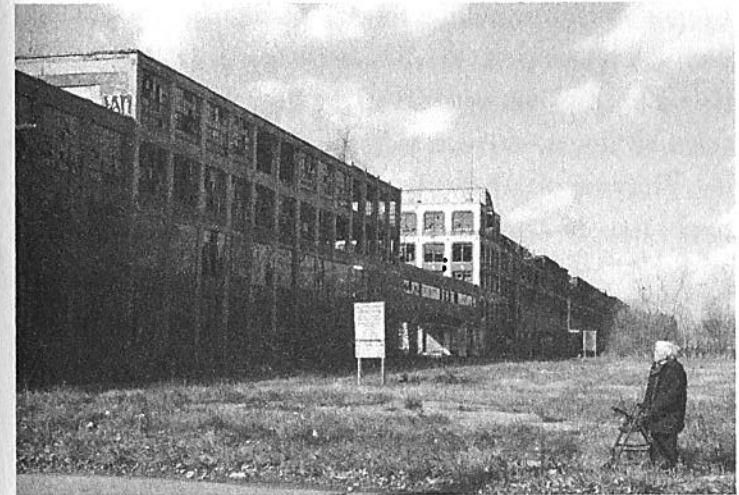
Figure 89. Still from Grace Lee Boggs, American Revolutionary